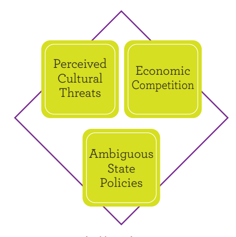
Figure 1. Main Drivers of Public Disfavour against Syrians

This policy brief aims to unpack this dilemma of hospitality and hostility going hand in hand by putting state's intentional ambiguous refugee policy at the center. The introduction reviews and assesses the public tensions both at state and societal levels based on the existing surveys and reports, and compares it with the data obtained from in-depth interviews with Syrian refugees based on their experience in the urban space. Then, the policy brief focuses on three dimensions, as stated in Figure 1, which are found to be key elements in forming up the public disfavour: (1) perceived cultural and ethnic threat, (2) economic competition over resources and rights, (3) ambiguous political agenda at state level. The brief concludes by providing certain key policy guidelines for state and civil society actors by focusing on improving the ambiguous aspects of the current refugee policies to better formulate mutual communication and understanding in future policies with the possibility of having a positive impact on lessening public tension with